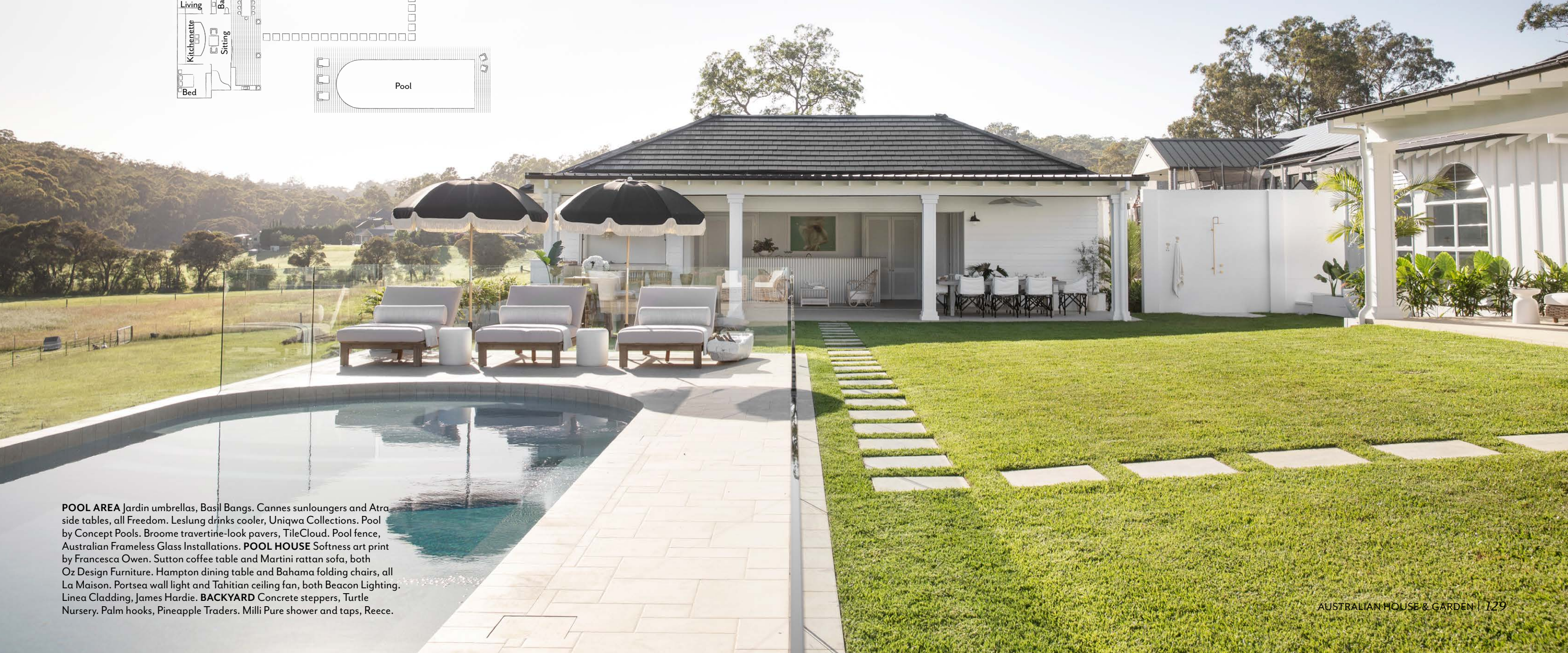
POOL AREA Jardin umbrellas, Basil Bangs. Cannes sunloungers and Atra side tables, all Freedom. Leslung drinks cooler, Uniqwa Collections. Pool by Concept Pools. Broome travertine-look pavers, TileCloud. Pool fence, Australian Frameless Glass Installations. POOL HOUSE Softness art print by Francesca Owen. Sutton coffee table and Martini rattan sofa, both Oz Design Furniture. Hampton dining table and Bahama folding chairs, all La Maison. Portsea wall light and Tahitian ceiling fan, both Beacon Lighting. Linea Cladding, James Hardie. BACKYARD Concrete steppers, Turtle Nursery. Palm hooks, Pineapple Traders. Milli Pure shower and taps, Reece.

See the full reveal of Louisa’s home at threebirdsrenovations.com .