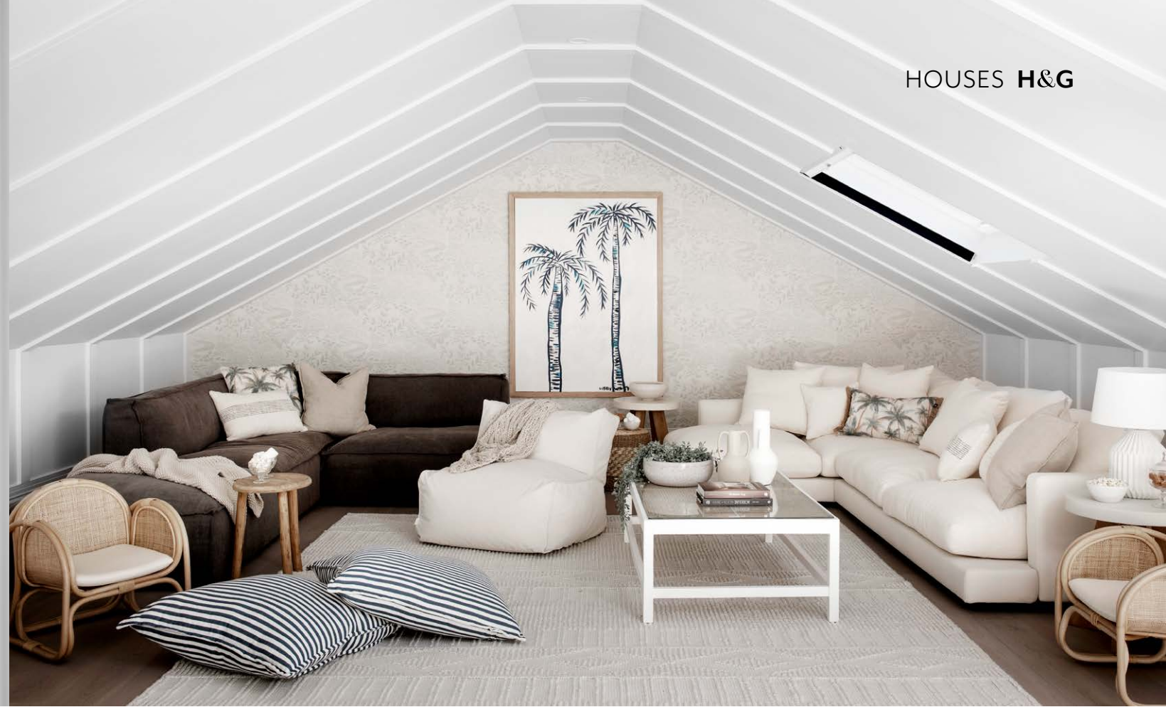
"I WANTED EVERY SPACE TO FEEL COMFY AND APPROACHABLE."