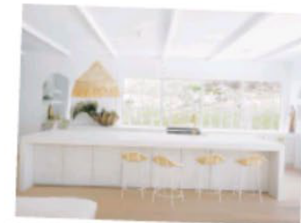
A Three Birds Renovations work.

While home improvement has always been something of a national pastime in Australia, the women agree there has never