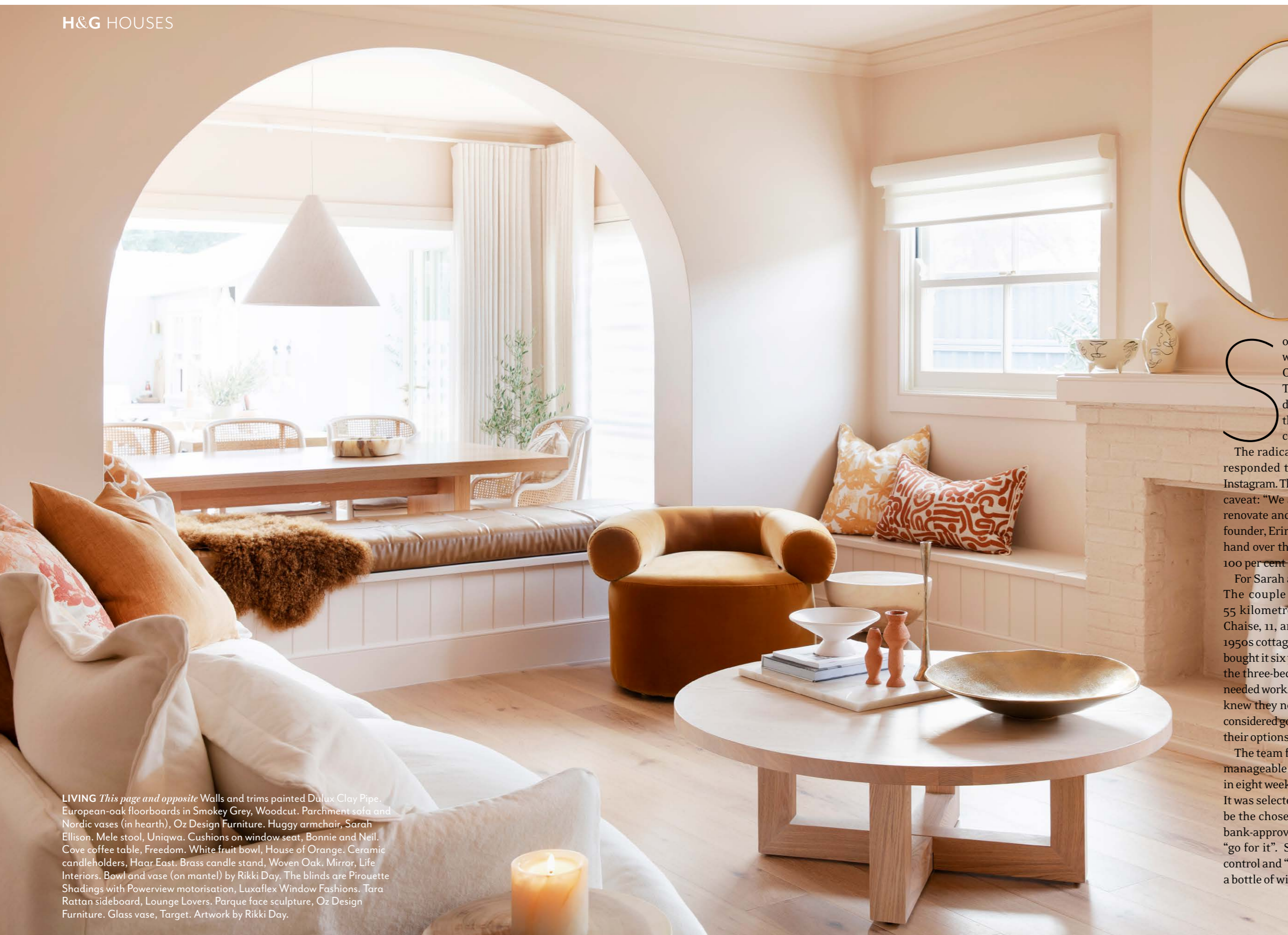
LIVING This page and opposite Walls and trims painted Dulux Clay Pipe. European-oak floorboards in Smokey Grey, Woodcut. Parchment sofa and Nordic vases (in hearth), Oz Design Furniture. Huggy armchair, Sarah Ellison. Mele stool, Uniqwa. Cushions on window seat, Bonnie and Neil. Cove coffee table, Freedom. White fruit bowl, House of Orange. Ceramic candleholders, Haar East. Brass candle stand, Woven Oak. Mirror, Life Interiors. Bowl and vase (on mantel) by Rikki Day. The blinds are Pirouette Shadings with Powerview motorisation, Luxaflex Window Fashions. Tara Rattan sideboard, Lounge Lovers. Parque face sculpture, Oz Design Furniture. Glass vase, Target. Artwork by Rikki Day.