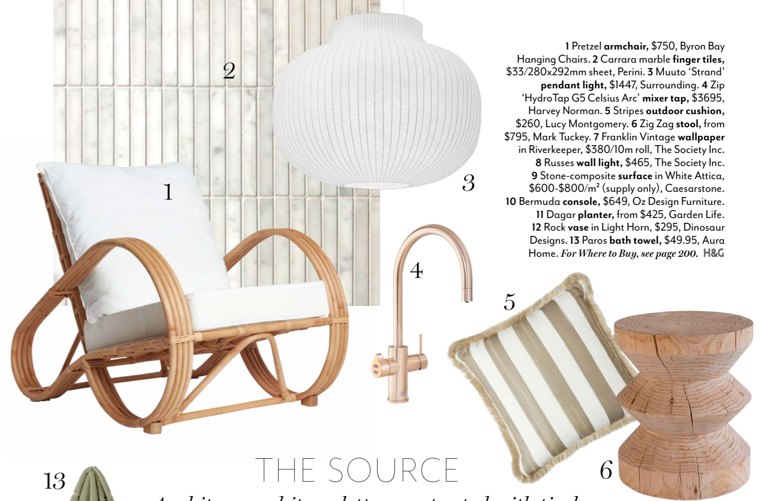
1 Pretzel armchair , $750, Byron Bay Hanging Chairs. 2 Carrara marble finger tiles , $33/280x292mm sheet, Perini. 3 Muuto 'Strand' pendant light , $1447, Surrounding. 4 Zip 'HydroTap G5 Celsius Arc' mixer tap , $3695, Harvey Norman. 5 Stripes outdoor cushion , $260, Lucy Montgomery. 6 Zig Zag stool , from $795, Mark Tuckey. 7 Franklin Vintage wallpaper in Riverkeeper, $380/10m roll, The Society Inc. 8 Russes wall light , $465, The Society Inc. 9 Stone-composite surface in White Attica, $600-$800/m 2 (supply only), Caesarstone. 10 Bermuda console , $649, Oz Design Furniture. 11 Dagar planter , from $425, Garden Life. 12 Rock vase in Light Horn, $295, Dinosaur Designs. 13 Paros bath towel , $49.95, Aura Home. For Where to Buy, see page 200. H&G