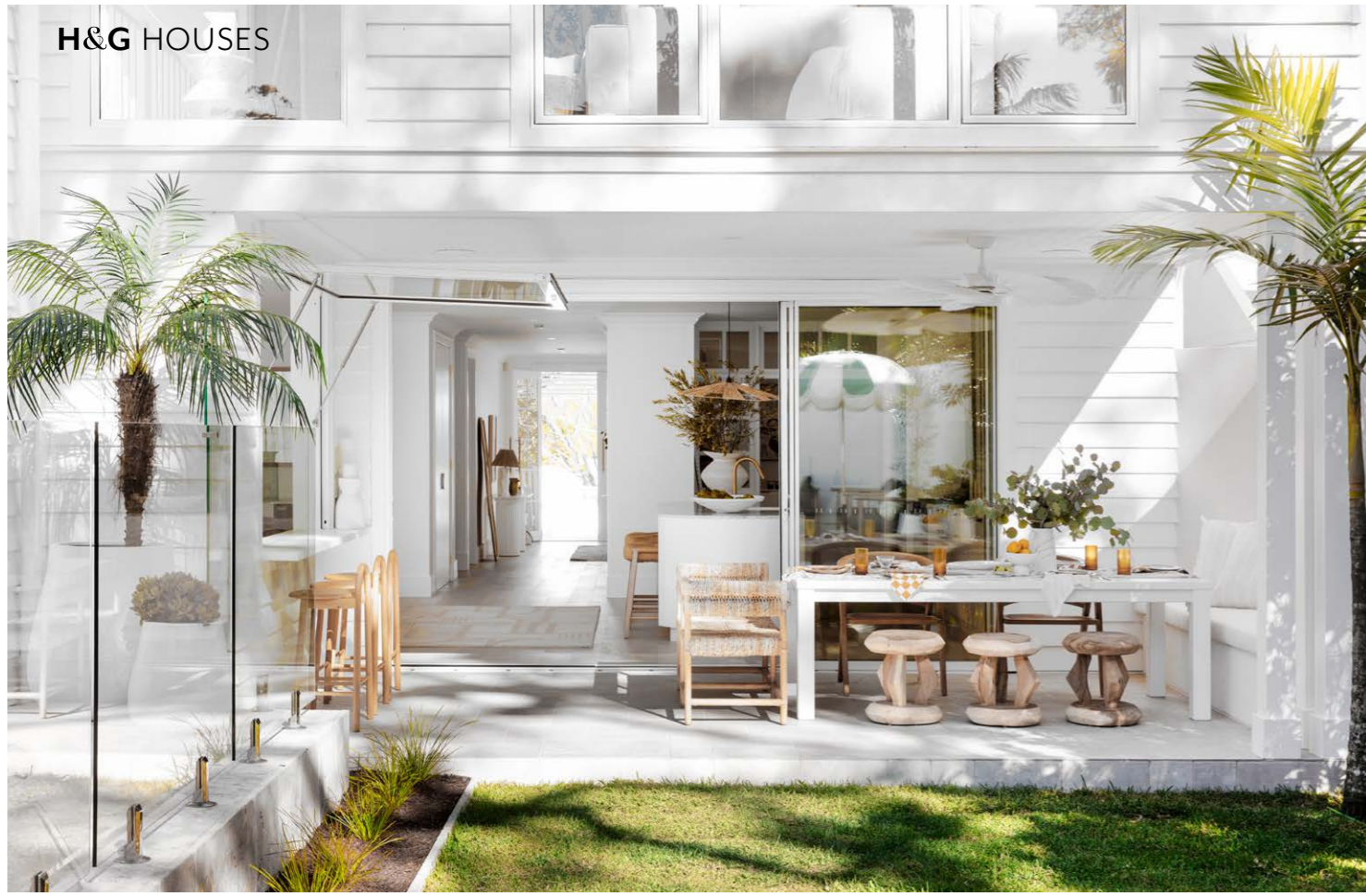
OUTDOOR DINING Above and below left The outdoor dining area is perfect for relaxed family dinners – or open the gas-strut servery window to create a bar and the whole area moves into entertaining mode. Myles dining table, House of Orange. Tablecloth and napkins, Bonnie and Neil. Glassware and cutlery, Freedom. Bench seat, Byron Bay Hanging Chairs. Tsuna stools, Uniqwa Collections. Dining chairs, Lounge Lovers. Bobby barstools, DesignByThem. Ceiling fan, Beacon Lighting. Servery window, Stegbar. LAUNDRY Custom joinery in Dulux Cat Mint, Carrera by Design. Shaws Lancaster single butler sink, and Mizu 'Drift' gooseneck tap in Brushed Gold, both Reece. Stool, Lounge Lovers. FIREPIT/FRONT GARDEN Filled with white crushed pebbles, this circular cut-out in the front lawn forms a perfect firepit and conversation corner. Firepit, Yagoona Design Australia. Armchairs, Byron Bay Hanging Chairs. Umbrella, Basil Bangs.