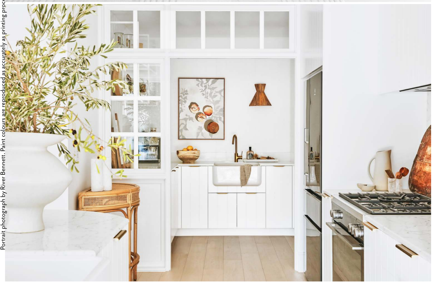
Paint colours are reproduced as accurately as printing processes allow.