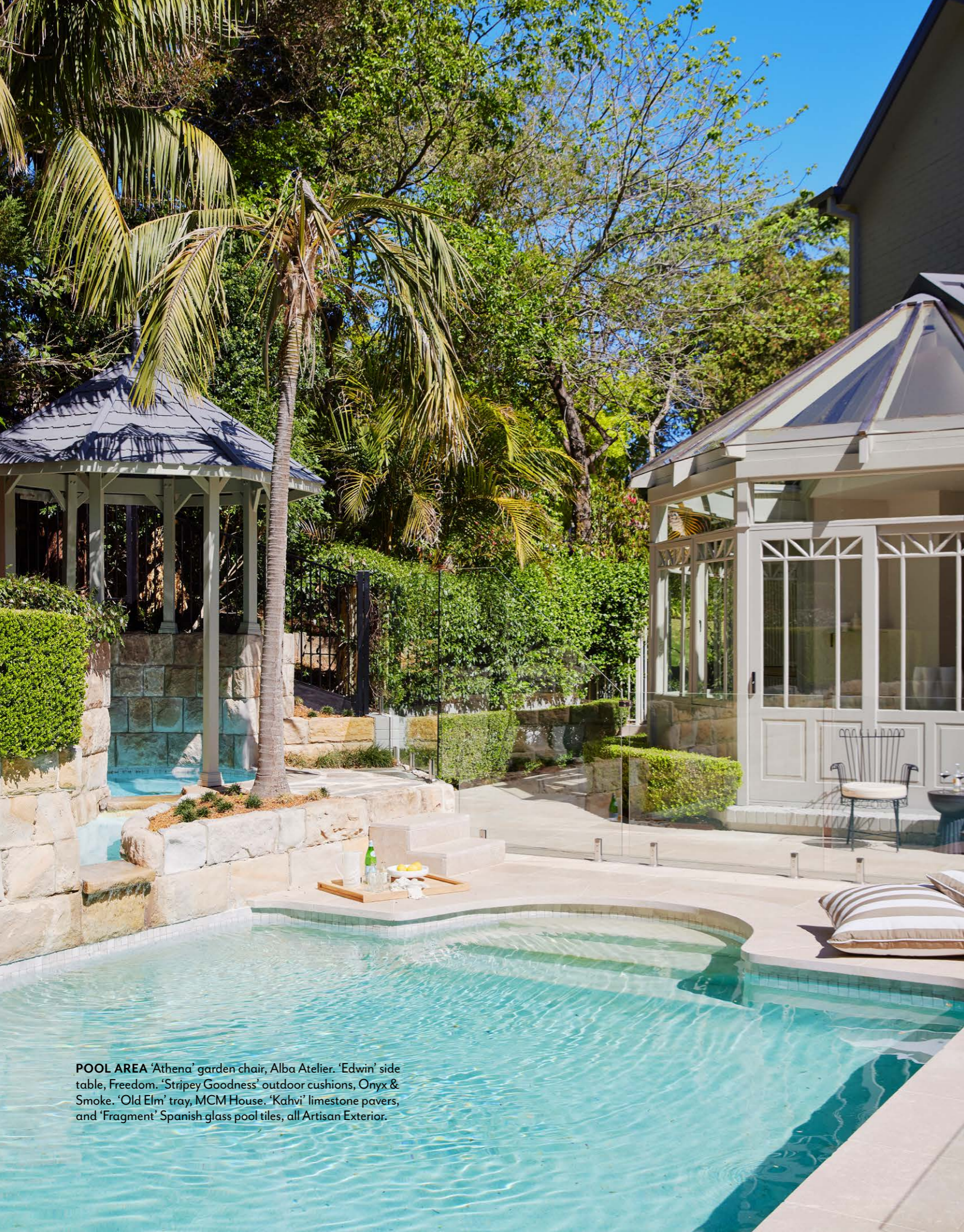
POOL AREA 'Athena' garden chair, Alba Atelier. 'Edwin' side table, Freedom. 'Stripey Goodness' outdoor cushions, Onyx & Smoke. 'Old Elm' tray, MCM House. 'Kahvi' limestone pavers, and 'Fragment' Spanish glass pool tiles, all Artisan Exterior.