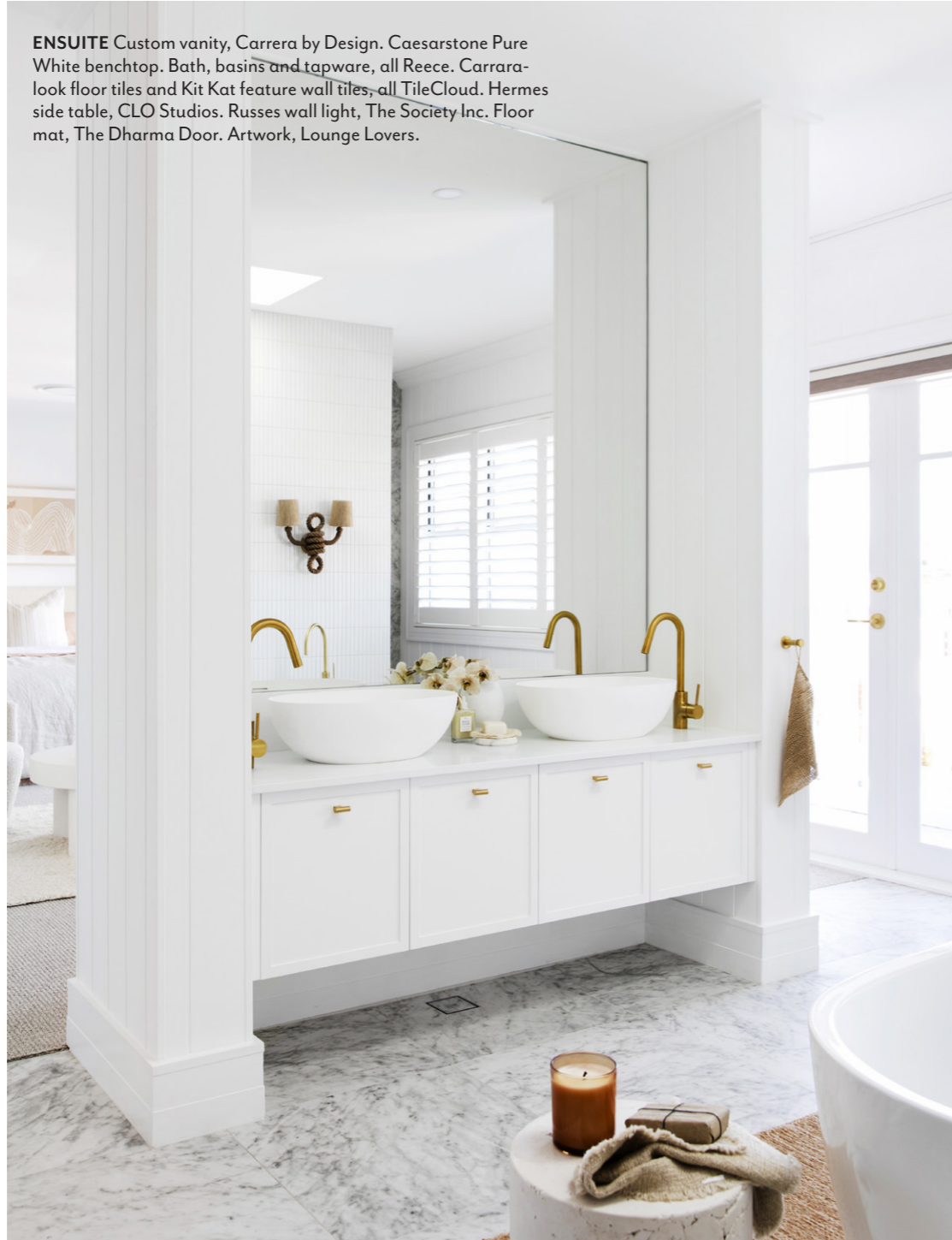
ENSUITE Custom vanity, Carrera by Design. Caesarstone Pure White benchtop. Bath, basins and tapware, all Reece. Carrara-look floor tiles and Kit Kat feature wall tiles, all TileCloud. Hermes side table, CLO Studios. Russes wall light, The Society Inc. Floor mat, The Dharma Door. Artwork, Lounge Lovers.