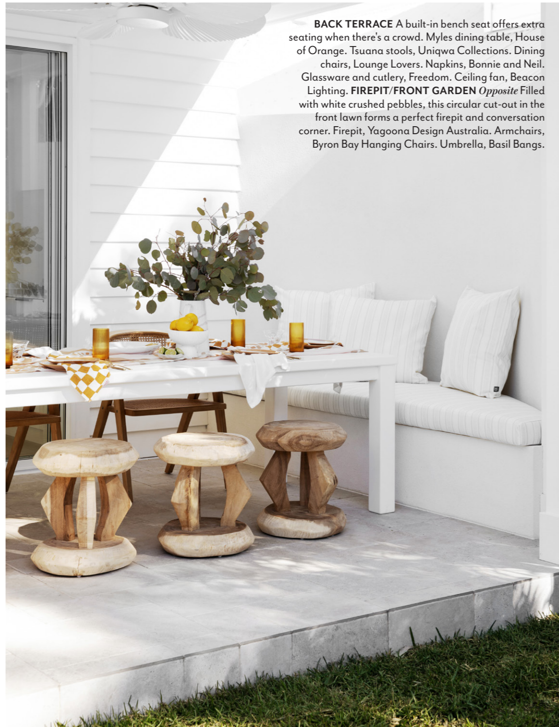
BACK TERRACE A built-in bench seat offers extra seating when there's a crowd. Myles dining table, House of Orange. Tsuana stools, Uniqwa Collections. Dining chairs, Lounge Lovers. Napkins, Bonnie and Neil. Glassware and cutlery, Freedom. Ceiling fan, Beacon Lighting. FIREPIT/FRONT GARDEN Opposite Filled with white crushed pebbles, this circular cut-out in the front lawn forms a perfect firepit and conversation corner. Firepit, Yagoona Design Australia. Armchairs, Byron Bay Hanging Chairs. Umbrella, Basil Bangs.