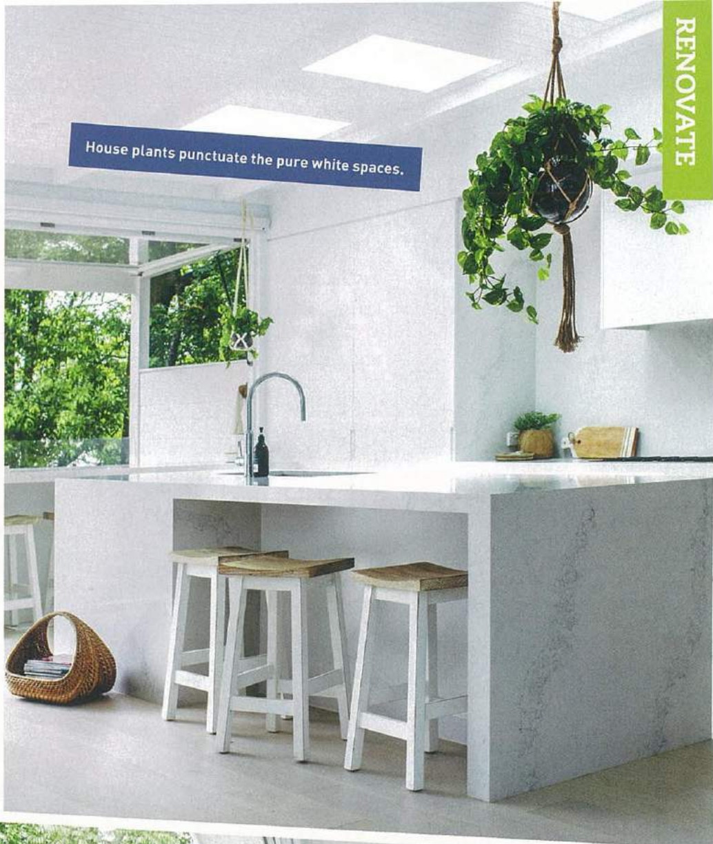
House plants punctuate the pure white spaces.

Lana's own home would be number six, and Three Birds Renovations created a stunning modern home, with a style made for comfort, glamour and Greek Island holidays. >