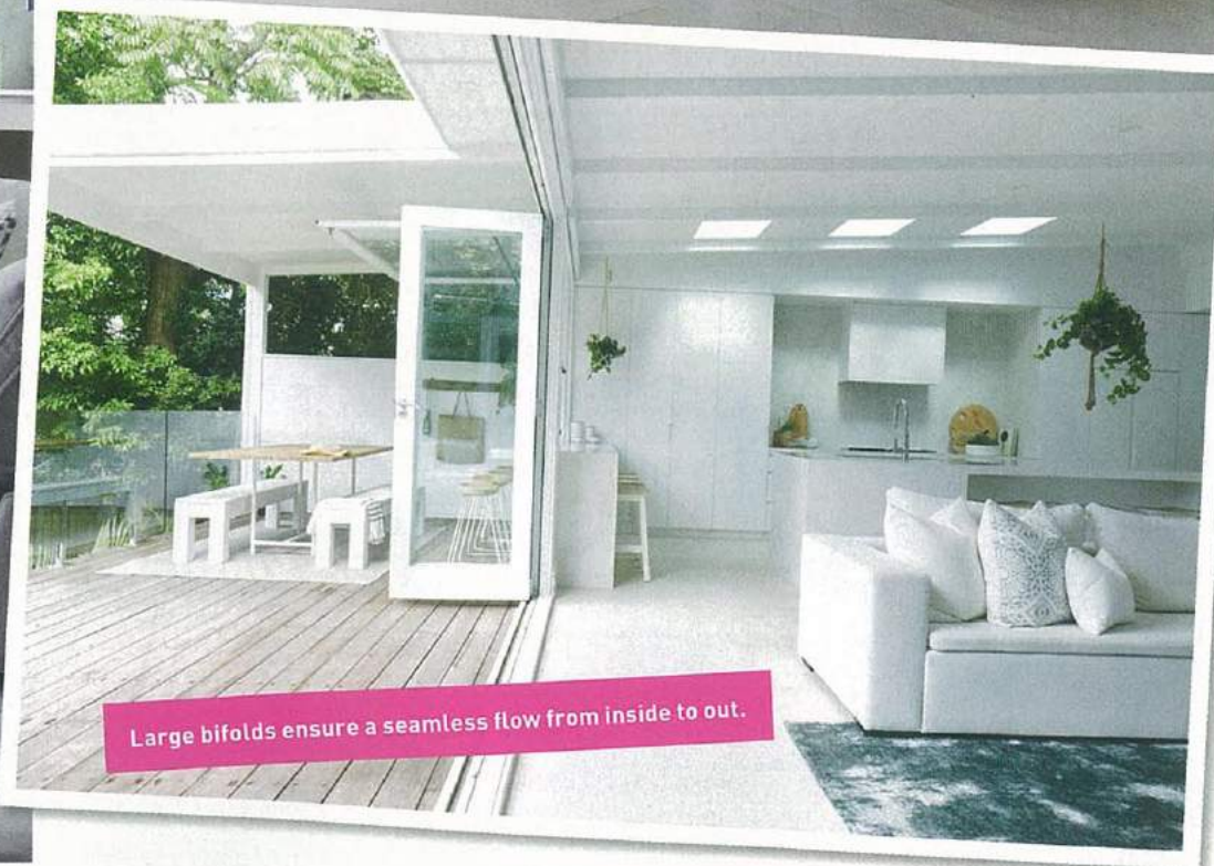
Large bifolds ensure a seamless flow from inside to out.