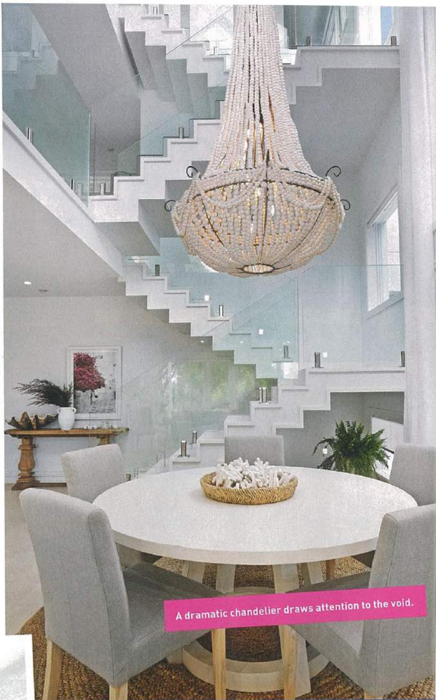
A dramatic chandelier draws attention to the void.

A void forms the literal and figurative centrepiece, even at the expense of floor space