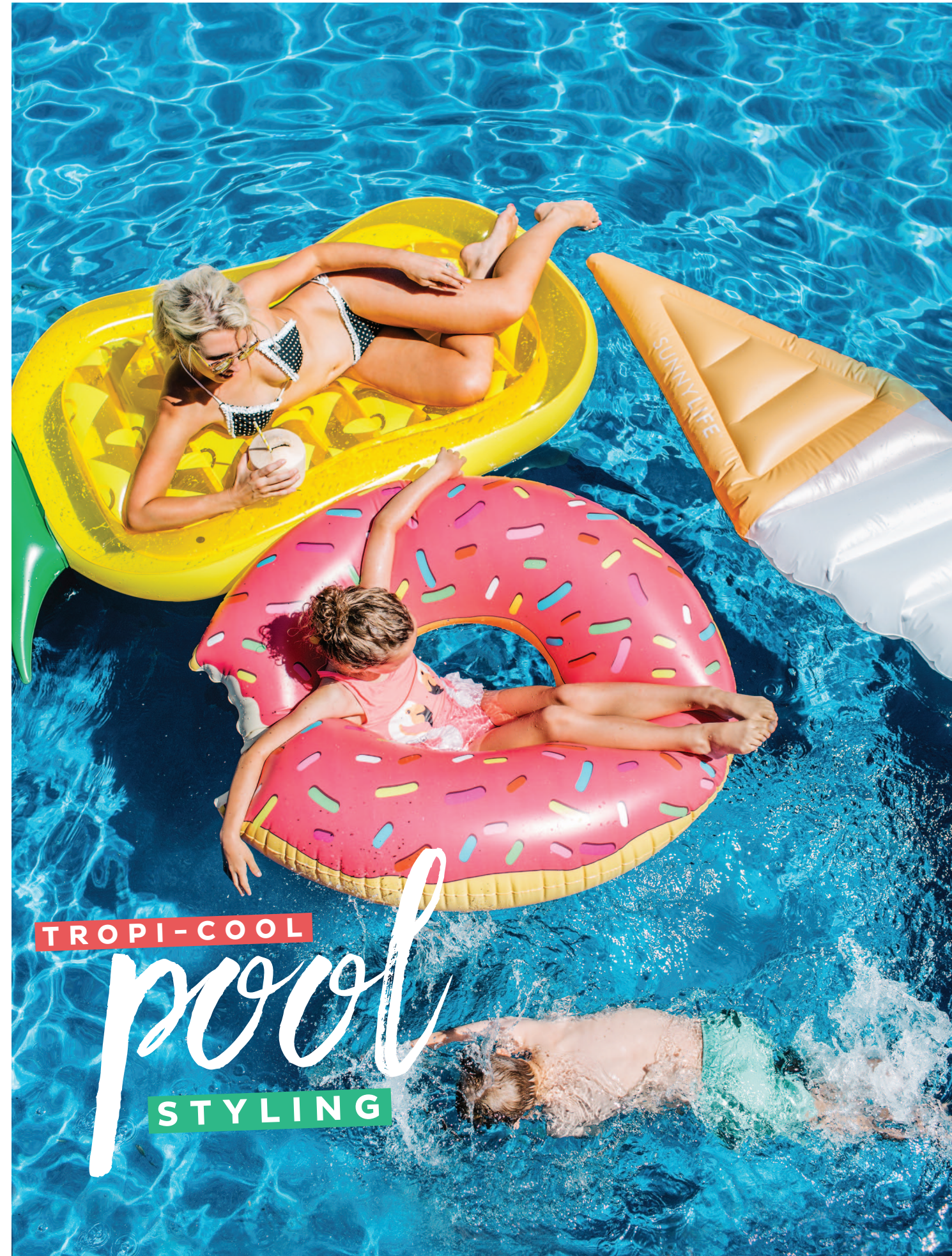
PHOTOGRAPHY HANNAH BLACKMORE / STYLING CLAUDIA STEPHENSON

NOTECARDS 'Shaka' notecards set of 5 blank notecards and envelopes US$14 mau-house.com NAIL POLISH Essie 'Style Hunter' nail polish $15.95 nailpolishaustralia.com BEACH UMBRELLA Basil Bangs 'Chaplin Stripe' beach umbrella $450 basilbangs.com BOTTLE OPENER Sunnylife green seahorse bottle opener $22.95 sunnylife.com.au BRONZER Bobbi Brown 'Illuminating' bronzer $60 mecca.com.au SWIMSUIT Marysia 'Mott' maillot one-piece swimsuit $572.90 jcrew.com/au HAT Eugenia Kim 'Sunny' sequined straw sunhat $628 net-a-porter.com/au SHOES Soludos classic stripe espadrille sandal $58 surfstitch.com TOTE Aloha Beach Club 'Sunshine' tote US$24.99 alohabeachclub.com POOL TOY Sunnylife inflatable pineapple $79.95 sunnylife.com.au BRACELET 'Bahia' wraparound bracelet $39 sageandclare.com