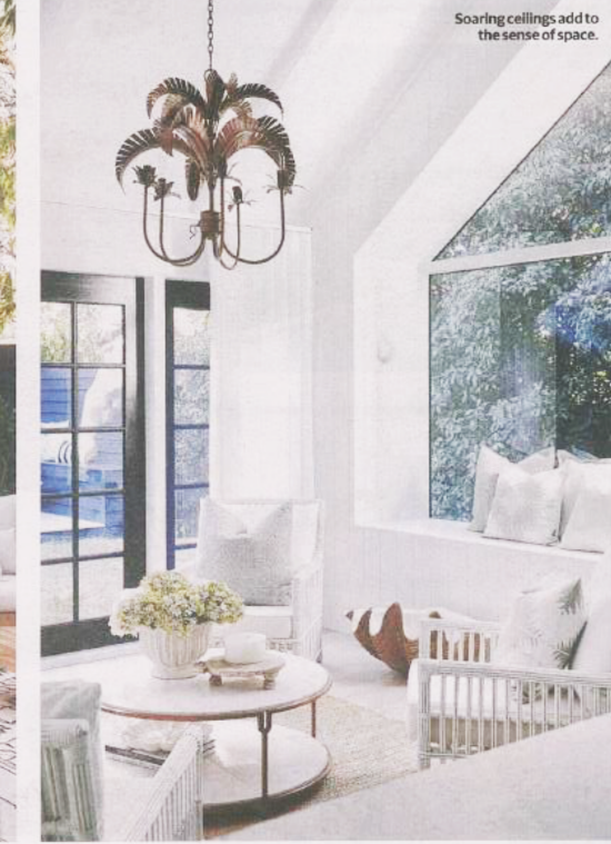
Soaring ceilings add to the sense of space.